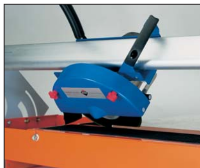
Taglio jolly • Mitering cut